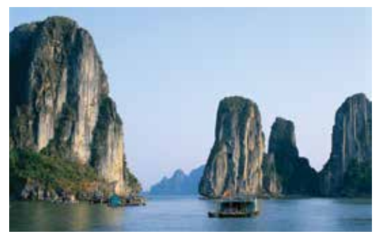
We visit Ha Long Bay on Day 4.

Day 14: Saigon This morning we visit the Cu Chi Tunnels, the infamous underground network from which North Vietnamese forces operated in wartime. Tonight we celebrate our journey over a farewell dinner. B.D.