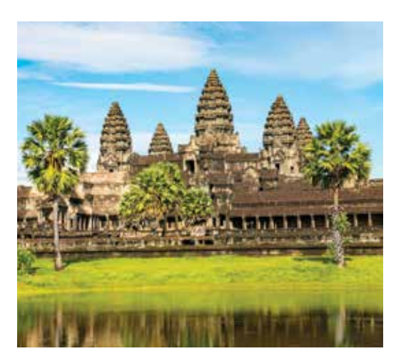
Angkor Wat (optional post-tour extension)

Day 13: Saigon A morning tour includes the former Presidential Palace, which served as the South Vietnamese government's wartime headquarters. Now known as Reunification Palace, it was here that the first Communist tanks rolled into Saigon on April 30, 1975; it remains preserved as a museum almost exactly as it was on that day. We also tour the History Museum, with its excellent collection of art and artifacts of the indigenous peoples of Vietnam. Later we attend a traditional water puppet performance. B , D