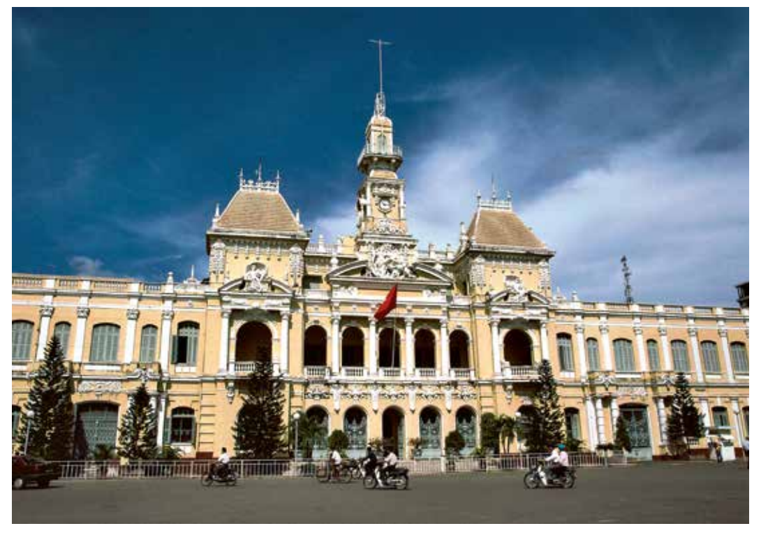
Observe the French architectural influences during a tour of Saigon on Day 13.

An then this afternoon is at leisure to either remain in Hoi An on your own or return to our beachside resort for a relaxing interlude. B , L