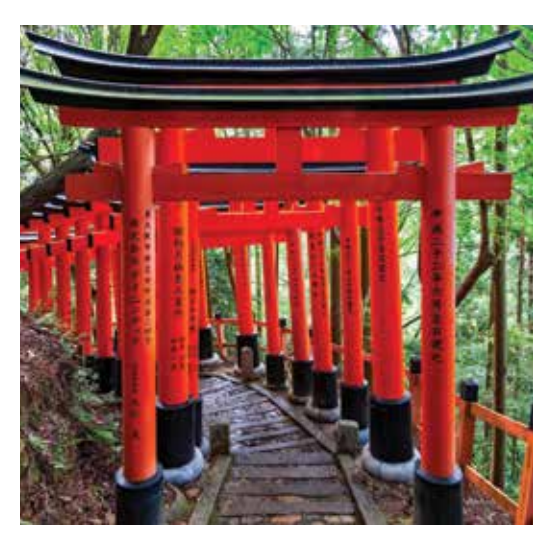
We visit Kyoto's Fushimi Inari shrine on Day 12.

Day 12: Kyoto We continue our encounter with Kyoto today. On tap: the important Fushimi Inari shrine, with its trails straddled by some 1,000 red torii gates and Sanjyusangendo Hall (ca. 1266), an