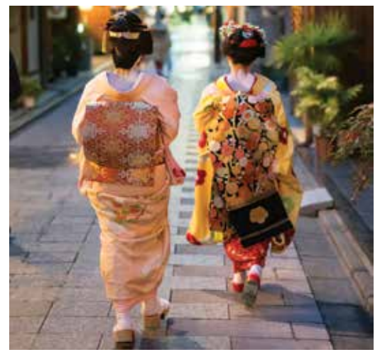
Geishas in traditional dress

important Buddhist temple housing 1,000 statues of the Thousand-Armed Kannon deity. Then this afternoon is at leisure; tonight we toast our Japan adventure at a farewell dinner at a local restaurant. B,D