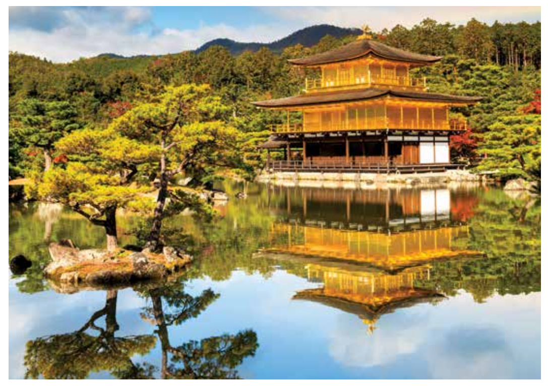
We visit Kyoto's Temple of the Golden Pavilion on Day 10.

Day 6: Hakone/Takayama Today we travel first by bullet train then by Wide View Hida express train to lovely Takayama in the Japanese Alps, considered one of the country's most attractive towns with its beautifully preserved Old Town. Our explorations center on three narrow streets in the San-machi-suji district where, in feudal times, merchants lived amidst the authentically preserved small inns, teahouses, and sake breweries. This afternoon we attend a traditional Japanese tea ceremony here, an historic ritual of form, grace, and spirituality. B , D